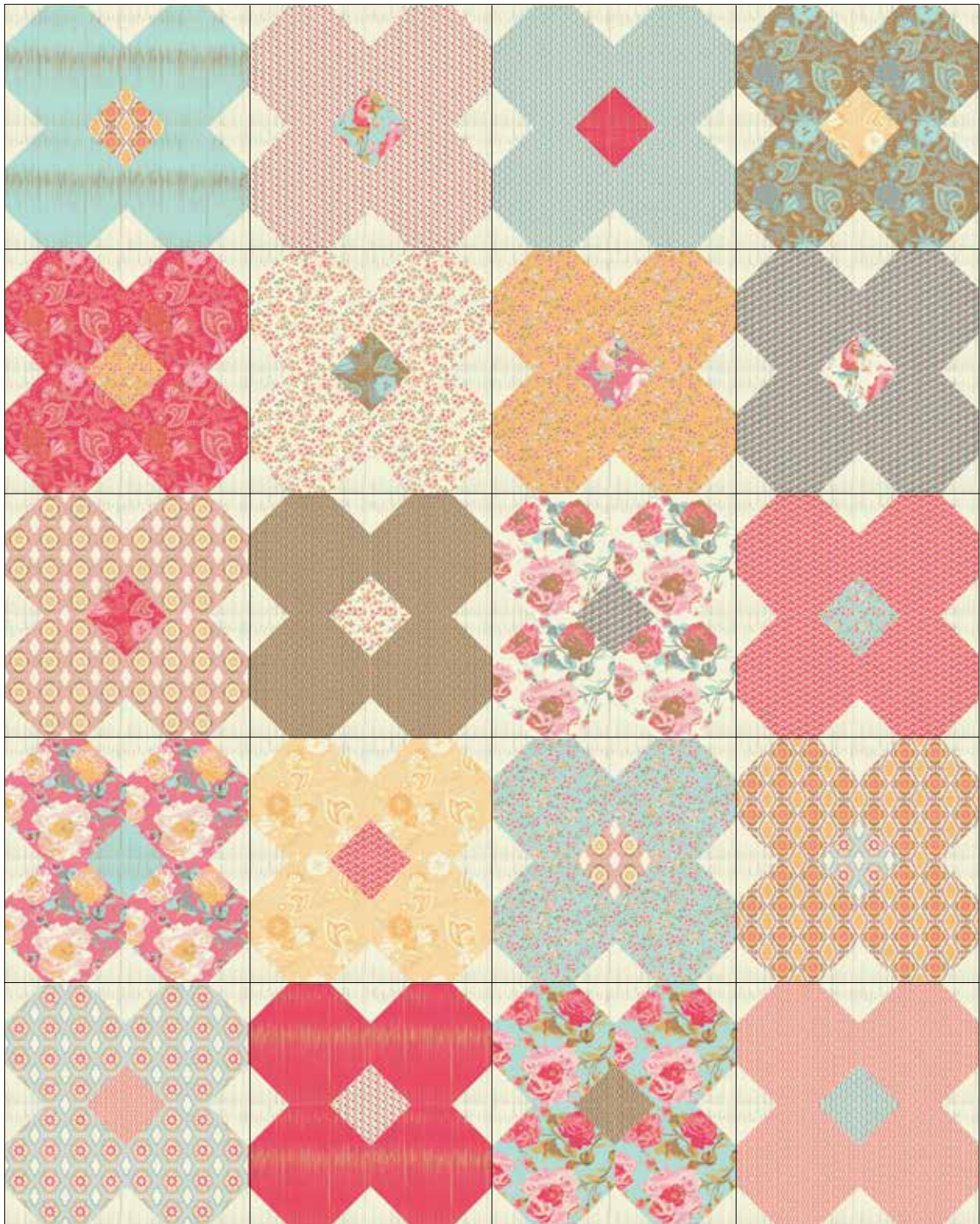
Quilt Center Diagram