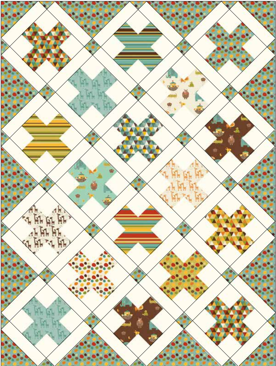
Quilt Center Diagram