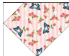
Unit B Left

Draw a line from corner to corner on the wrong side of 2 Riley white solid 1\frac{1}{4} " squares. Place a Riley white solid 1\frac{1}{4} " square on the top left corner of a Unit A with right sides together and sew on the line. Leave a \frac{1}{4} " seam allowance and trim excess. Press to complete Unit B Left. Repeat on the top right corner of the second Unit A. Press to complete Unit B Right.