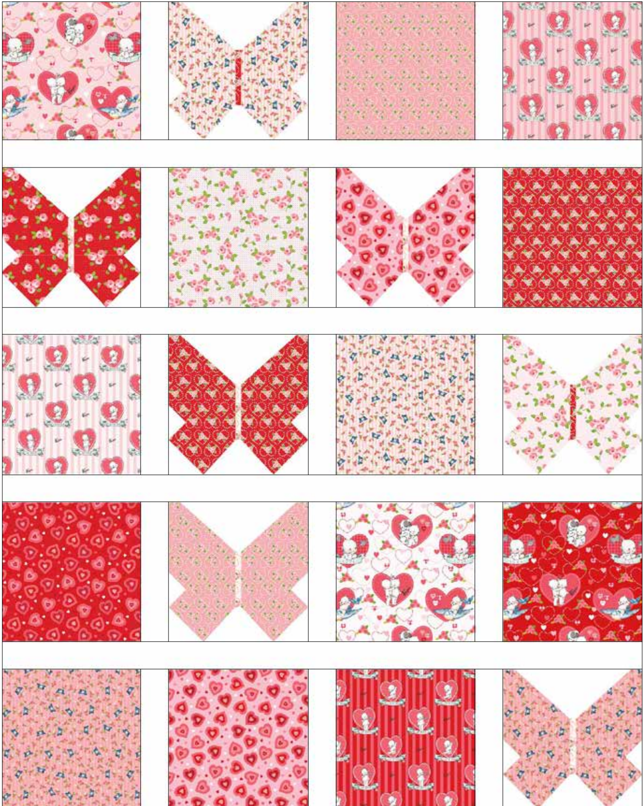
Quilt Center Diagram