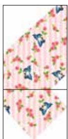
Right Wing Unit

Sew a Riley white solid 1 " x 4\frac{3}{8} " rectangle to the short side of a cream or red rose 1 " x 4\frac{3}{8} " rectangle. Press. Sew a Riley white solid 1 " x 3 " rectangle to the other short side of the cream or red rose 1 " x 4\frac{3}{8} " rectangle to create the Center Unit.