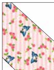
Unit C Left

Draw a line from corner to corner on the wrong side of 2 Riley white solid 4\frac{3}{8} " squares and 2 Riley white 1\frac{3}{4} " squares. Place a Riley white solid 4\frac{3}{8} " square on the top right corner of an assorted print 5\frac{1}{4} " x 6\frac{3}{4} " rectangle (the 5\frac{1}{4} " side is the top) with right sides together and sew on the line. Leave a \frac{1}{4} " seam allowance and trim excess. Press. Place a Riley white solid 1\frac{3}{4} " square on the bottom left corner of the assorted print 5\frac{1}{4} " x 6\frac{3}{4} " rectangle. Leave a \frac{1}{4} " seam allowance and trim excess. Press to complete Unit C Left. Place a Riley white solid 4\frac{3}{8} " square on the top left corner of an assorted print 5\frac{1}{4} " x 6\frac{3}{4} " rectangle with right sides together and sew on the line. Leave a \frac{1}{4} " seam allowance and trim excess. Press. Place a Riley white solid 1\frac{3}{4} " square on the bottom right corner of the assorted print 5\frac{1}{4} " x 6\frac{3}{4} " rectangle. Leave a \frac{1}{4} " seam allowance and trim excess. Press to complete Unit C Right.