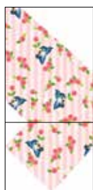
Left Wing Unit

Sew the Unit B Left and the Unit C Left together to create a Left Wing Unit. Sew the Unit B Right and the Unit C Right together to create a Right Wing Unit.