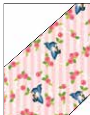
Unit C Right

Sew the Unit B Left and the Unit C Left together to create a Left Wing Unit. Sew the Unit B Right and the Unit C Right together to create a Right Wing Unit.