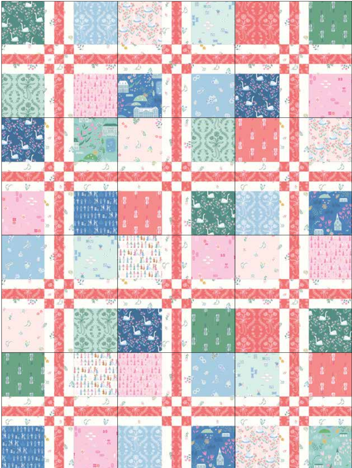
Quilt Center Diagram