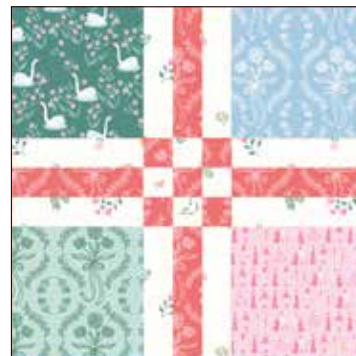
Formal Gardens Block

Sew 4 assorted print 5" squares, 4 Unit As, and a Nine-Patch Unit together to create the Formal Gardens Block. Repeat to make 12 Formal Gardens Blocks.