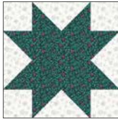
Large Star Block

Sew a Unit A to the top and bottom of the Center Unit to complete the Large Star Block. Repeat to make 12 Large Star Blocks.